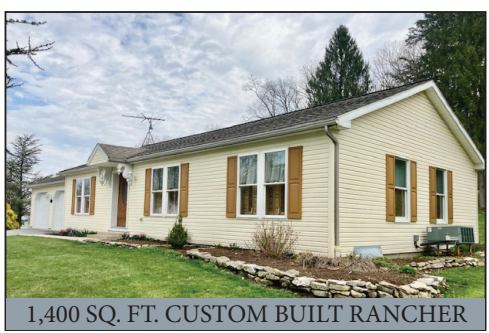
Located at 1310 Briertown Rd. East Earl, Pa. East Earl Twp. Lancaster Co.

DIRECTIONS: In Blue Ball Rt. 322 E. 1-mile to Rt. 897 S. 1-mi. to left on Briertown Rd. to home on right.