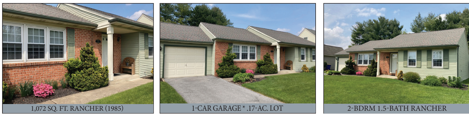
Located at 235 W. Spruce St. New Holland, Pa. 17557

DIRECTIONS: From Main St. (Rt. 23) New Holland take Mentzer Ave. N. to right on W. Spruce to home on left.