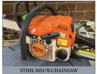
STIHL MS170 CHAINSAW

TOOLS & MISC. FARM ITEMS: 725K Grasshopper Z-Turn Mower (NICE!); Pelican Kayak; 2-Lewis Back-Scratchers; Stihl MS170 Chainsaw; 10" Table Saw; 12" Chop Saw; Wrench & Socket Sets; DeWalt 20V Grease Gun; Bench Grinder; Dinner Bell; Lots of Misc. Hand & Power Tools; 30-5' Round Lifetime Tables; Werner Ladders; Feed Carts; Top-Links; Barn Pulleys; plus much more!.