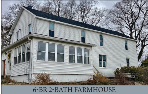
6-BR 2-BATH FARMHOUSE

SAT. JUNE 10, 2023 @ 9-AM/Real Estate @ 1-PM