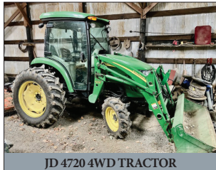
JD 4720 4WD TRACTOR

Located at 165 Muenster Rd. St. Marys, PA 15857