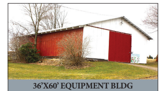
36'X60' EQUIPMENT BLDG