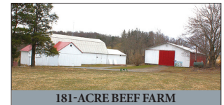
181-ACRE BEEF FARM

For photos & complete listing visit www.martinandrutt.com