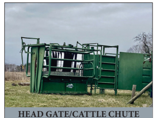
HEAD GATE/CATTLE CHUTE

For photos & complete listing visit www.martinandrutt.com