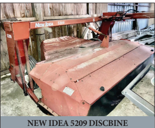
NEW IDEA 5209 DISCBINE

TRACTORS & FARM EQUIPMENT: John Deere 4720 4WD WF DSL Cab Tractor w/400CX loader; John Deere 5525 4WD WF DSL Cab Tractor w/542 loader 4900hrs; 3-pt PTO Worksaver Bale un-wrapper; 966 IH WF DSL Cab Tractor, engine rebuilt 2021; CLAAS 340 Rollant round baler (8-yrs NICE!) ; McHale Bale Wrapper 991TL; New Idea 5209 Discbine; Mahindra 72" Brush Mower; 2014 Kubota RTV1100 DSL; JD 350 Manure Spreader; 3-pt Puma 72" Snow Blower attachment & external hydraulic pump; 10,000GVW 16' Dump Trailer; 7,000GVW 16' Landscape Trailer; Custom Rear-Discharge Fertilizer Spreader; 3-pt PTO under-fence mower; 3-pt bale fork; pallet fork & bale spear attachments; 8'grain drill; NH 256 rol-a-bar hay rake; 7'sickle-bar trailer type mower' NH Hay Tedder; IH 540 4-btm plow; JD 5920 12' Packer; IH 10'Disc; 2-Harrows; Field Cultivator; JD iMatch Weight Box & Suitcase Weights; 3-pt PTO Fertilizer Hopper; 15+Round Grass Hay Bales; 300-gal DSL Tank on Skids; POWDER RIVER Cattle Chute System; etc.