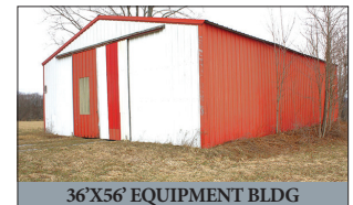
36'X56' EQUIPMENT BLDG