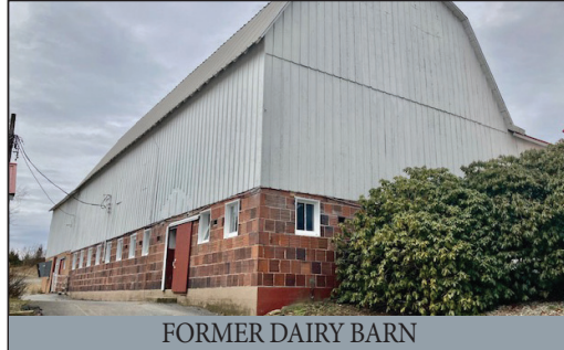
FORMER DAIRY BARN