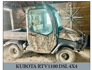
KUBOTA RTV1100 DSL 4X4

TOOLS & MISC. FARM ITEMS: 725K Grasshopper Z-Turn Mower (NICE!); Pelican Kayak; 2-Lewis Back-Scratchers; Stihl MS170 Chainsaw; 10" Table Saw; 12" Chop Saw; Wrench & Socket Sets; DeWalt 20V Grease Gun; Bench Grinder; Dinner Bell; Lots of Misc. Hand & Power Tools; 30-5' Round Lifetime Tables; Werner Ladders; Feed Carts; Top-Links; Barn Pulleys; plus much more!.