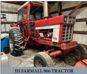
IH FARMALL 966 TRACTOR