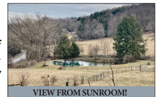
VIEW FROM SUNROOM!