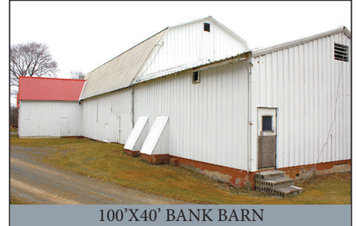
100'X40' BANK BARN

Located at 165 Muenster Rd. St. Marys, PA 15857