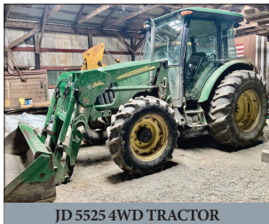
JD 5525 4WD TRACTOR