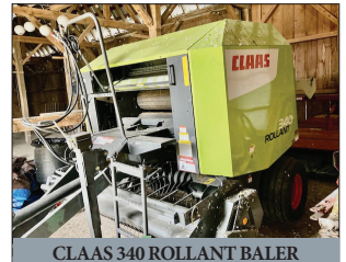
CLAAS 340 ROLLANT BALER

TRACTORS & FARM EQUIPMENT: John Deere 4720 4WD WF DSL Cab Tractor w/400CX loader; John Deere 5525 4WD WF DSL Cab Tractor w/542 loader 4900hrs; 3-pt PTO Worksaver Bale un-wrapper; 966 IH WF DSL Cab Tractor, engine rebuilt 2021; CLAAS 340 Rollant round baler (8-yrs NICE!) ; McHale Bale Wrapper 991TL; New Idea 5209 Discbine; Mahindra 72" Brush Mower; 2014 Kubota RTV1100 DSL; JD 350 Manure Spreader; 3-pt Puma 72" Snow Blower attachment & external hydraulic pump; 10,000GVW 16' Dump Trailer; 7,000GVW 16' Landscape Trailer; Custom Rear-Discharge Fertilizer Spreader; 3-pt PTO under-fence mower; 3-pt bale fork; pallet fork & bale spear attachments; 8'grain drill; NH 256 rol-a-bar hay rake; 7'sickle-bar trailer type mower' NH Hay Tedder; IH 540 4-btm plow; JD 5920 12' Packer; IH 10'Disc; 2-Harrows; Field Cultivator; JD iMatch Weight Box & Suitcase Weights; 3-pt PTO Fertilizer Hopper; 15+Round Grass Hay Bales; 300-gal DSL Tank on Skids; POWDER RIVER Cattle Chute System; etc.