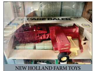
NEW HOLLAND FARM TOYS

Silver Coins @ 9-AM: Lots of silver dollars, halves, qtrs, dimes, etc. Early coin collection books-some partials; Coins not on premises until sale day!