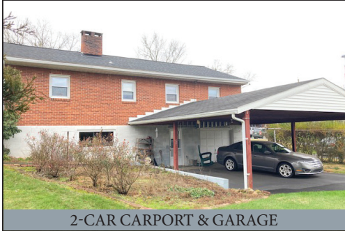
2-CAR CARPORT & GARAGE

3-BDRM 1.5 BATH BRICK RANCHER w/CARPORT * .24-AC. ANTIQUES * SILVER COINS * FARM TOYS & TRUCKS * TOOLS SAT. MAY 6, 2023 @ 9-AM/Real Estate @ NOON