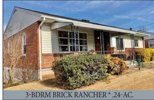
3-BDRM BRICK RANCHER * .24-AC.