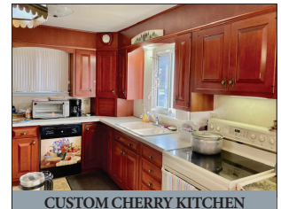
CUSTOM CHERRY KITCHEN