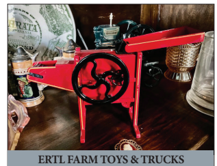
ERTL FARM TOYS & TRUCKS