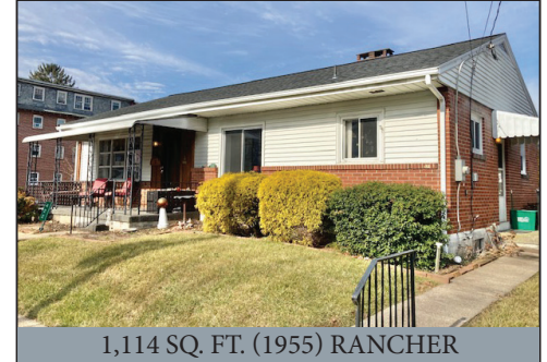
1,114 SQ. FT. (1955) RANCHER

Located at 422 Washington Ave. Ephrata, Pa. 17522