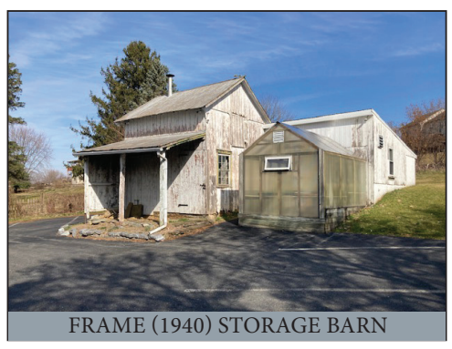
Located at 4298 Division Highway, East Earl, PA 17519

DIRECTIONS: From Rt.322/23 in Blue Ball follow Rt. 322 E. ¼ mile to property on left.