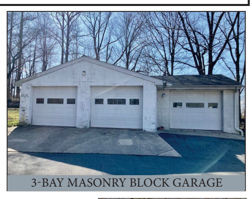
Located at 248 Loop Rd. Quarryville, PA Eden Twp. Lancaster Co.

DIRECTIONS: From Strasburg area take May Post Office Rd. S. 4.5 mi. to right on Stony Hill Rd. to left on Loop Rd to home on right.