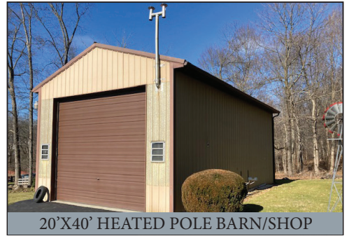
Located at 271 Lammey Rd. Elverson, PA W. Nantmeal Twp. Chester Co.

DIRECTIONS: From Morgantown, PA take Rt. 23 E. to R. on 401 E. to right on (Rt. 82 S.) follow N. Manor Rd. to left on Lammey Rd. to auction site.