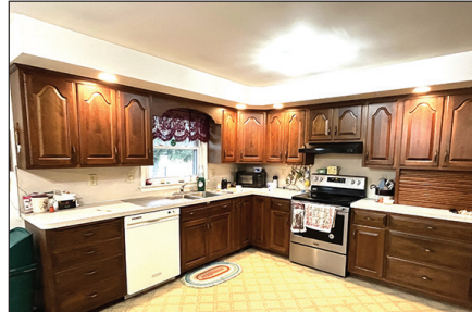
HUGE EAT-IN KITCHEN