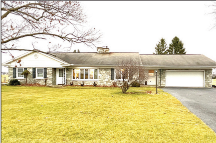
REAL STONE RANCHER