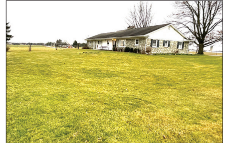
NICE COUNTRY SETTING

Located at 641 W. Lincoln Ave. Lititz Pa. 17543