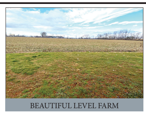
Located at 1820 & 1822 Lampeter Rd. Lancaster Pa. 17602

DIRECTIONS: From the traffic light in Lampeter, travel South on Lampeter Rd. for .2 mile to property on right.