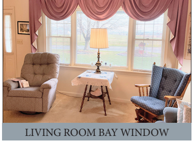
Located at 478 N. Railroad Ave. New Holland Pa. 17557

DIRECTIONS: From New Holland, travel North on N. Railroad Ave. for 1 mile to property on left.