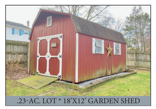
Located at 532 Westfield Dr. New Holland, PA 17557

DIRECTIONS: From New Holland (Rt. 23) W. Main St. take N. Hoover Ave. 2-blocks to left on Westfield Dr. to home w/black railing on left.