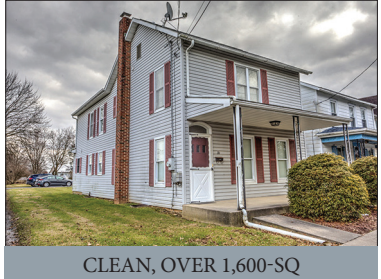
Located at 31 N. 11th St. Akron Pa 17501

DIRECTIONS: From Main St. & Rt. 272 intersection in Akron, travel East on Main St. and turn left on N. 11th St to property on the right.