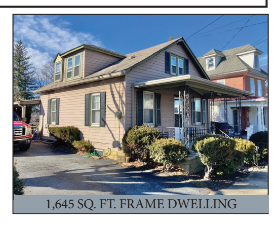
Located at: 20 N. 9th Street, Akron, PA 17501

DIRECTIONS: From Akron, Pa. Rt. 272 take Main St. E. 1-block to left on N. 9th St. to home on left.