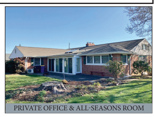
Located at: 197 Hillcrest Rd. New Holland, Pa. 17557

DIRECTIONS: From Main St. (Rt. 23) New Holland take S. Railroad Ave ¼ mi. to home on right @ corner of Hillcrest & Railroad.