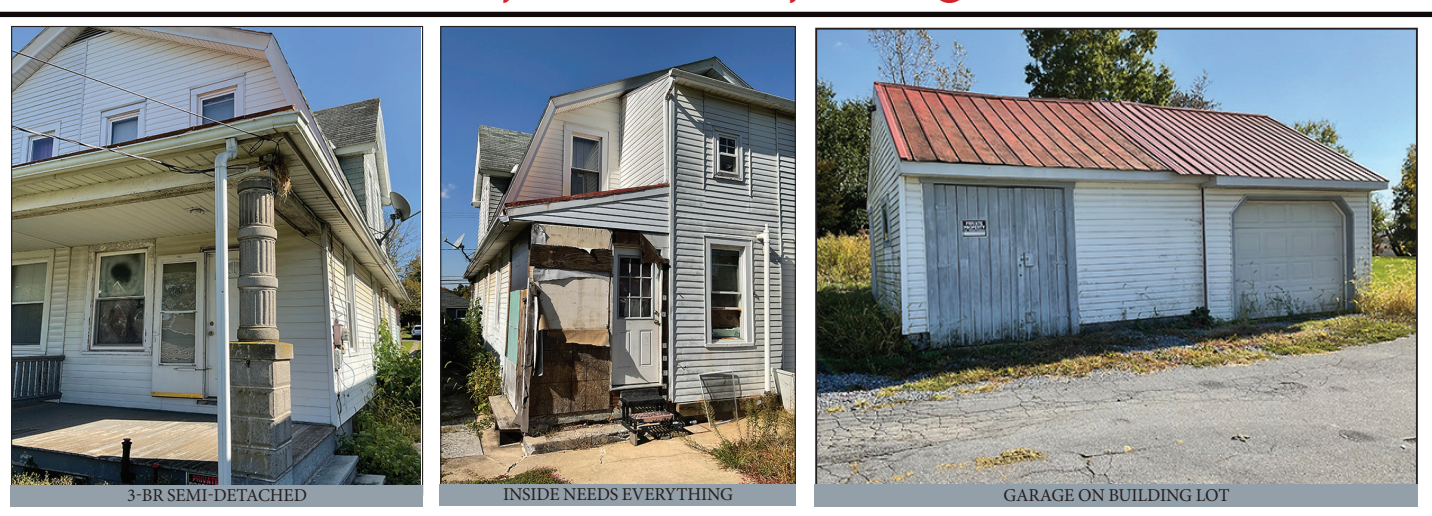
Located at 240 W. Main St. & SS W Park St. Newmanstown Pa. 17073

DIRECTIONS: From Schaefferstown, travel North on Rt. 419, property is on the right as you enter the town of Newmanstown.