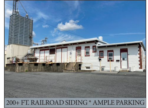
200+ FT. RAILROAD SIDING * AMPLE PARKING

Located at: 217 S. Railroad Ave. New Holland, Pa. 17557