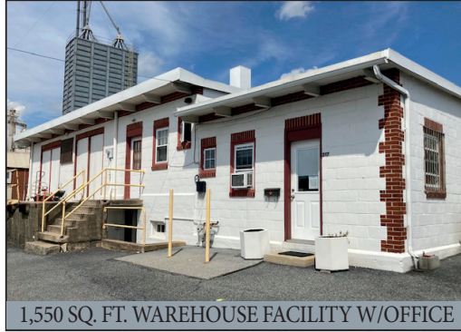
1,550 SQ. FT. WAREHOUSE FACILITY W/OFFICE