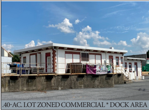
.40-AC. LOT ZONED COMMERCIAL * DOCK AREA

COMMERCIAL ZONED DISTRIBUTION FACILITY * .40-AC. LOT 1,550 Sq. Ft. CONCRETE BUILDING w/9-LOADING DOCKS MONDAY, OCTOBER 3, 2022 @ 4-PM