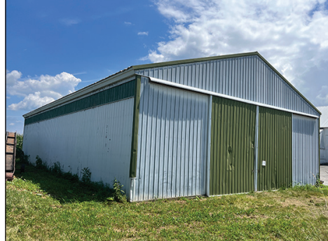
72'X 44' EQUIP. SHED