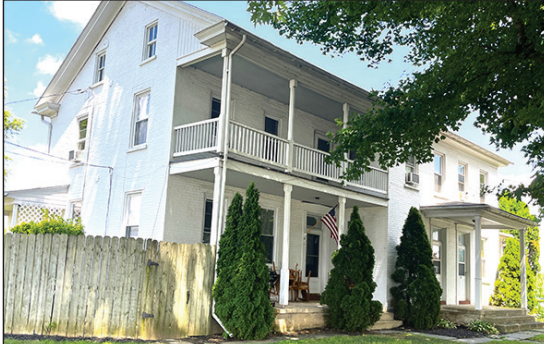
DOUBLE HOUSE * 7-BR

55.6 ACRE FARM * GREAT SOIL * GENTLE SLOPE GREAT FOR BEEF, CROPS, PRODUCE * 2 SILOS EQUIPMENT BUILDING & BANK BARN * GRAIN BIN SATURDAY, OCTOBER 15, 2022 @ 11:00 AM