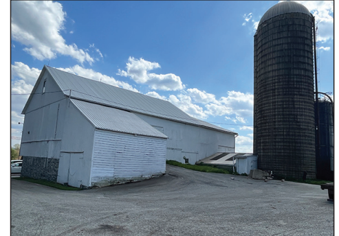
100'X 60' BANK BARN

Located at 819 & 821 Penn Grant Rd. Lancaster Pa. 17602