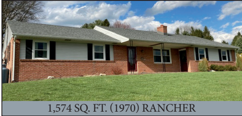
1,574 SQ. FT. (1970) RANCHER