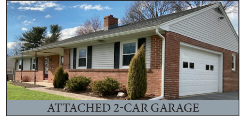
ATTACHED 2-CAR GARAGE

Located at 129 Summitville Rd. New Holland, Pa. Earl Twp. Lancaster Co.