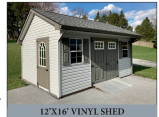
12'X16' VINYL SHED

REAL ESTATE: consists of a 1,574 sq. ft. solid (1970) brick rancher w/attached 2-car garage on a rural .46-acre lot. Main floor features a covered front porch; a 12'x18' formal living room w/bay window & brick fireplace; custom cherry cabinetry kitchen w/appliances; 12'x11' dining room w/access to rear patio; mudroom; 2-full baths; 3-bedrooms w/closets; attached heated 2-car garage; laundry hook-up; attic access; 1,334 sq. ft. basement w/finished family/rec room; 14'x20' utility room; Bilco access door; electric heat; on-site well & public sewer; annual taxes: $3,532; new 12'x16' vinyl utility shed; nice macadam driveway; low maintenance brick rancher w/recent valuable new windows, doors & roof. Interior needs some cosmetic updates.