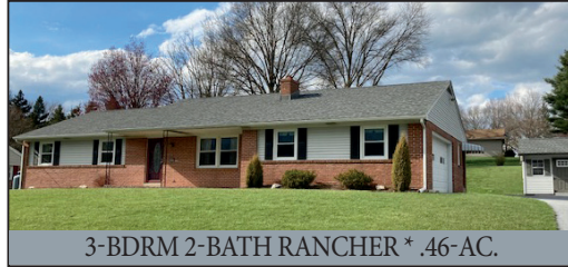
3-BDRM 2-BATH RANCHER * .46-AC.