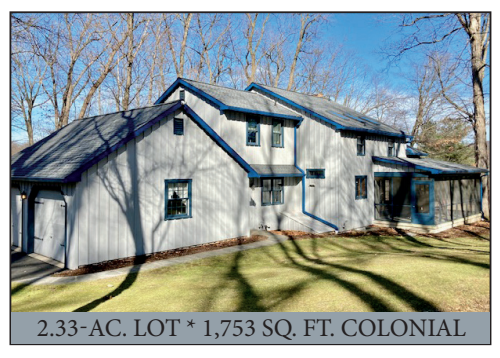
Located at 480 Swamp Rd. Morgantown, PA Caernarvon Twp. Lancaster Co.

DIRECTIONS: From Churchtown Rt. 23 E. to left on California Rd. 2-mi. to property on right @ Swamp Rd.