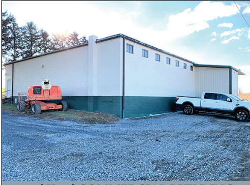
100' X 60' COMMERCIAL BUILDING

COMMERCIAL STYLE BUILDING * .58 ACRE LOT * HEAT & A/C 100'x 60' BLOCK BUILDING * 2 LOADING DOCKS & GROUND LEVEL DOOR THURSDAY MARCH 31, 2022 @ 5:00 PM