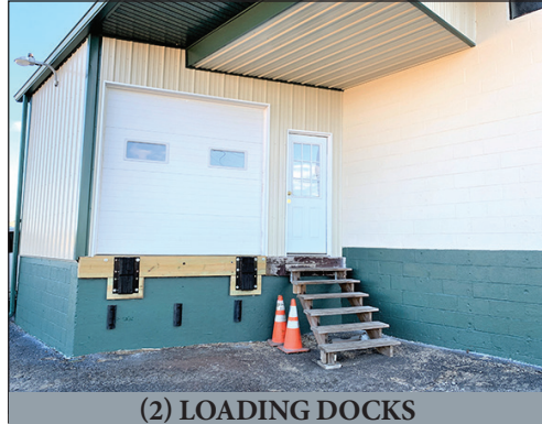
(2) LOADING DOCKS