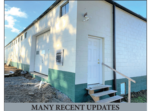
MANY RECENT UPDATES

Located at 190 Martin Rd. Myerstown Pa. 17067