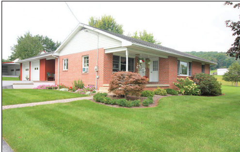
3-BR BRICK RANCHER

SATURDAY, OCTOBER 30, 2021 @ 8:30 AM * R.E. @ 1:00 PM