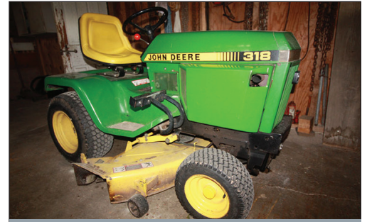
JOHN DEERE #318 TRACTOR

Located at 491 E. Church St. Stevens Pa. 17578