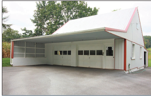
GARAGE OR HORSE BARN