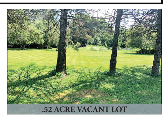
Located at 39 N. Maple Ave. Leola Pa.

DIRECTIONS: From Rt. 23 & Rt. 772 intersection in Leola, travel East on Rt. 23 for ½ mile and turn left on N. Maple Ave., to auction on right. (Beside Leola Community Park)