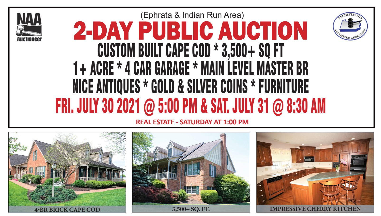
Located at 552 Stevens Rd. Ephrata Pa. 17522

DIRECTIONS: From Schoeneck Rd. & Rt. 272 intersection, travel North on Schoeneck Rd. for ¼ mile and turn left on Stevens Rd, to property on right.