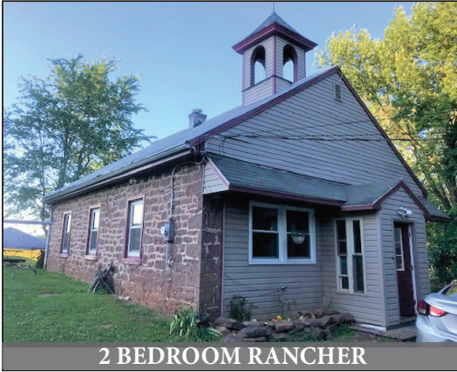
2 BEDROOM RANCHER

2 BEDROOM STONE HOUSE * 1-LEVEL * NICE .30 ACRE LOT * READY TO MOVE-IN * CLEAN SATURDAY, AUGUST 29, 2020 @ NOON