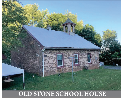
OLD STONE SCHOOL HOUSE