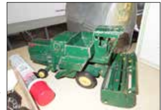
FARM TOYS & TRUCKS

Antiques & Personal Property: agate pails & coffee pot; wire egg basket; pedal tractor; farm toys; Winross & Ertl trucks; whiskey barrel; 2-chicken crates; glass butter churn; glass lightning rod; Metzler's church bench; old medicine cabinet; school desk; early comforter; primitive tools, wood planes; cast iron trough; poly porch swing; PVC picnic table; early wooden washing machine; metal bed; dining table & chairs; desk; queen bedding; chest freezer; fridge; single & dbl beds w/bedding; dresser; night stand; sofa; wooden rocker; lots of misc. kitchen & baking items; glassware; home décor; 4-3'x8' tables; plus much more not listed.