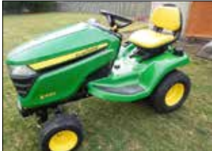
JOHN DEERE X390 MOWER

Located at 270 Reifsnnyder Rd. Lititz, Pa. Elizabeth Twp. Lancaster Co.