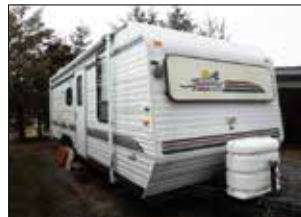
26' SUNLINE CAMPER

Antiques & Personal Property: agate pails & coffee pot; wire egg basket; pedal tractor; farm toys; Winross & Ertl trucks; whiskey barrel; 2-chicken crates; glass butter churn; glass lightning rod; Metzler's church bench; old medicine cabinet; school desk; early comforter; primitive tools, wood planes; cast iron trough; poly porch swing; PVC picnic table; early wooden washing machine; metal bed; dining table & chairs; desk; queen bedding; chest freezer; fridge; single & dbl beds w/bedding; dresser; night stand; sofa; wooden rocker; lots of misc. kitchen & baking items; glassware; home décor; 4-3'x8' tables; plus much more not listed.