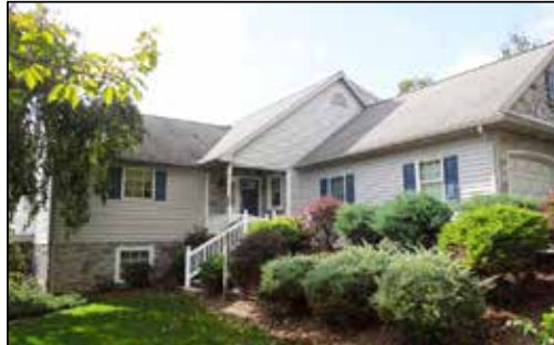
CUSTOM 1.5 STORY HOME * 1.5-AC. LOT