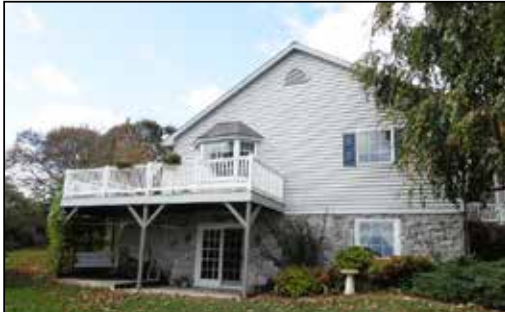
WRAP-AROUND DECK * WALK-OUT BASEMENT

CUSTOM 3-BDRM 1.5 STORY DWELLING w/3-CAR GARAGE * 1.5-AC. LOT! 2-BAY TRUCK GARAGE/SHOP * 1-BAY GARAGE * UTILITY BARN GUNS * TRACTORS * 26' CAMPER * 4X4 GMC TRUCK * ANTIQUES * TOOLS SAT. JUNE 6, 2020 @ 9-AM/Real Estate @ 12:30 PM