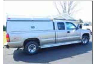
2000 GMC 4 X 4 2500 SLT TRUCK

Truck: one-owner 2000 GMC 4X4 2500 SLT pick-up truck, extended cab, 60/40 front bench seat; 8' bed, 6.0L Vortec V8, auto-trans; leather & power loaded; 199k mi; tool box & ladder rack; inspected thru 6-20; serial # 1GTG-K29U3Y3406184