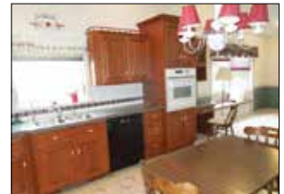
CUSTOM CABINETRY KITCHEN

REAL ESTATE: consists of a (1999) custom built stone & vinyl sided 2,914 sq. ft. Cape Cod style dwelling w/3-car garage; 2-bay truck garage/shop & utility barn on 1.5-acres. Main floor features an impressive foyer w/curved open staircase; ½ bath; an eat-in style custom Foxcraft raised panel cherry kitchen w/appliances, Formica counter-tops, tile back splash, pantry & built-in desk; family room w/bay window seat & French doors to wrap-around deck w/power awning; office w/private entrance; laundry; formal living room; master suite w/cathedral window & 2-dbl closets; private bath w/dbl vanity & whirlpool tub; upper level has 2-large bedrooms & full bath; attic storage; daylight basement w/woodstove; rec room; central AC; oil furnace w/1,000 gal fuel tank; central vac; on-site well & septic; water treatment system; insulated windows; macadam drive & parking area; annual taxes: $6,744. Outbuildings: a 1,536 sq. ft. frame 2-bay truck garage/shop w/mezzanine storage; 16'x24' 1-bay lean-to garage; 10'x14' utility shed; open front shed.