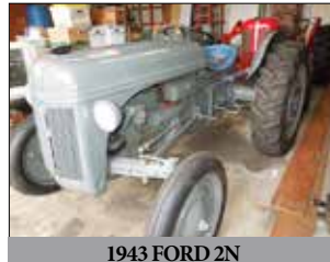
1943 FORD 2N

10-Guns: (NOT ON PREMISIS) Marlin Glenfield #25 .22 cal. bolt; J Stevens #235 12-ga dbl brl side/side; Sears 12-ga single shot; Stevens #59A .410 bolt; Savage #820B 12-ga pump; J Stevens 12-ga single shot; Kessler Arms #228FR 16-ga bolt action w/clip; JC Higgins #740 .410 bolt single shot; .22 cal. Marlin Glenfield mod #25 w/3x9 scope; .22 cal. Marlin Glenfield mod #25.