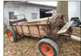
NEW IDEA #10 SPREADER

10-Guns: (NOT ON PREMISIS) Marlin Glenfield #25 .22 cal. bolt; J Stevens #235 12-ga dbl brl side/side; Sears 12-ga single shot; Stevens #59A .410 bolt; Savage #820B 12-ga pump; J Stevens 12-ga single shot; Kessler Arms #228FR 16-ga bolt action w/clip; JC Higgins #740 .410 bolt single shot; .22 cal. Marlin Glenfield mod #25 w/3x9 scope; .22 cal. Marlin Glenfield mod #25.