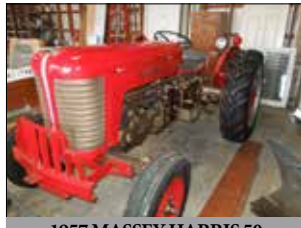
1957 MASSEY HARRIS 50

Tractors, Trailers; Equipment & Tools: Restored tractors: 1957 Massey Harris 50; 1943 Ford 2N; 1957 Oliver 55; Ferguson 2-btm 14" plow & set of new shears; NI #10 ground-drive spreader; John Deere X390 22hp lawn tractor w/48" deck, 158hrs, 44" snow blower attachment; Troy-Bilt pony tiller; 1997 26' Sunline camper; Premier 16' dual axle 7000GVW car carrier trailer; Simplicity 12hp walk-behind tractor w/sickle-bar mower, cultivator, disc, snow blade, plow & cart; 3-pt Howard PTO roto-beater; Ferguson 2-row 3-pt cultivator; 3-pt PTO chipper; 6' Land Pride 3-pt. scraper blade; 8' heavy duty 3-pt. scraper blade; Honda 3500 generator; Tapco 10' aluminum brake; 20' pick plank; scaffolding sets; 28' aluminum ext. ladder & jacks; Craftsman 10" table saw, bench vise; radial arm saw; drill press; Echo 18" chain saw; wheelbarrow; poly leaf cart; Lincoln 225 amp welder; LP tanks & heater; LB-10 laser level & stand; measure wheel; handyman & jack; many power & hand tools; garden tools; lots of misc. building materials-doors, windows, siding, etc.; step ladders; car ramps & jacks; air tank; milk cans; tool cabinet on wheels; wrench & socket sets; pipe wrenches; pump jacks; torpedo heater; etc.