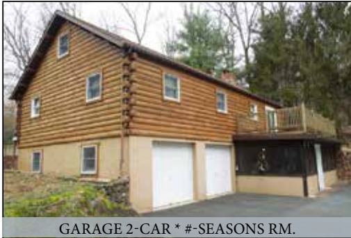
GARAGE 2-CAR * #-SEASONS RM.

3-4 BDRM 1.5 STORY LOG HOME w/2-CAR GARAGE * 1.12-AC. LOT GREAT ROOM * 2-BATHS * 3-SEASONS ROOM * UTILITY BARN THURSDAY, JUNE 4, 2020 @ 6-PM