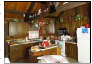
OAK CABINETRY KITCHEN