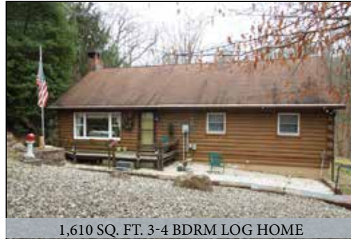
1,610 SQ. FT. 3-4 BDRM LOG HOME