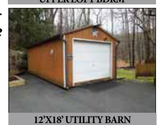
12'X18' UTILITY BARN

OPEN HOUSE: SAT. MAY 16 & 23 from 1-3 PM for info call auctioneer @ (717) 371-3333.