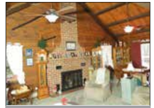
GREAT RM W/LP FIREPLACE

REAL ESTATE: consists of a (1978) 1,610 sq. ft. 1.5 story log home on a wooded 1.12-ac. lot. Main floor includes a 28'x20' great room featuring a soaring cathedral ceiling w/rustic open beams & rafters, pine finished paneling & ceiling, brick LP fireplace, dining area w/sliding door to 10'x22' rear deck; open stairs to upper loft 12'x18' bedroom; raised panel oak cabinetry kitchen w/center island & glass-top range, microwave, DW, & fridge; full bath & 3-bedrooms w/ closets; lower level includes a partially improved rec room w/LP aux. stove; laundry; full bath; 3-seasons screened porch w/private entrance; 2-car garage; electric heat; insulated windows; on-site well & septic system; LP water heater; 500 gallon LP tank; water treatment system; annual taxes: $4,386. Outbuilding: a 12'x18 utility barn/garage; nice macadam drive & parking area; beautiful sandstone retaining walls & steps.