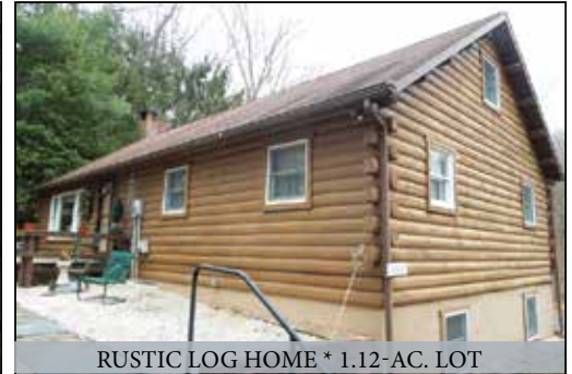
RUSTIC LOG HOME * 1.12-AC. LOT

Located at 76 Fox Rd. Newmanstown, Pa. Elizabeth Twp. Lancaster Co. Warwick Schools