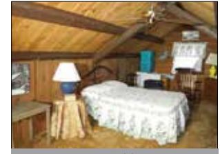
UPPER LOFT BDRM