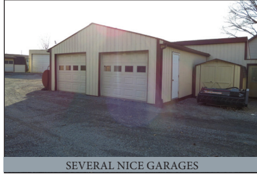
SEVERAL NICE GARAGES