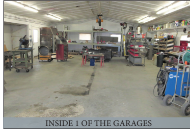
INSIDE 1 OF THE GARAGES