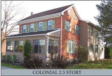
COLONIAL 2.5 STORY