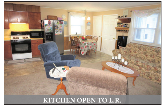
KITCHEN OPEN TO L.R.

Located at 716 Red Run Rd. New Holland Pa 17557