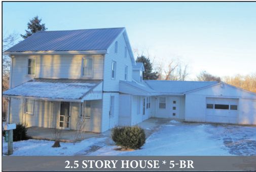
2.5 STORY HOUSE * 5-BR