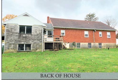
BACK OF HOUSE