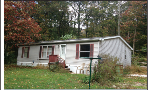
TRACT #3: 6.3-ACRES W/2-BR MODULAR

Properties located along Welsh & Quarry Rd. just east of Rt. 10. Directions from Honey Brook take Rt. 10 N. to right on Welsh Rd. From Morgantown take Rt. 10 S. to left on Welsh Rd. to Quarry Rd.