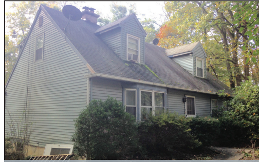
TRACT #2: 2.2-AC. LOT W/4-BR CAPE COD