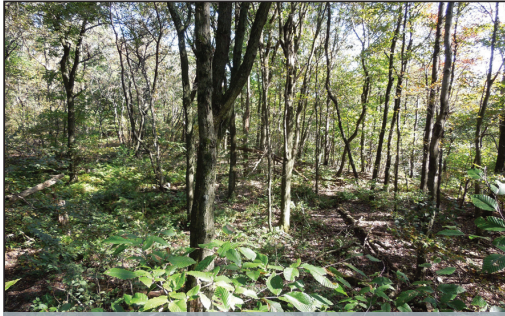
TRACT #1: 10.8-AC. TRACT WOODLAND