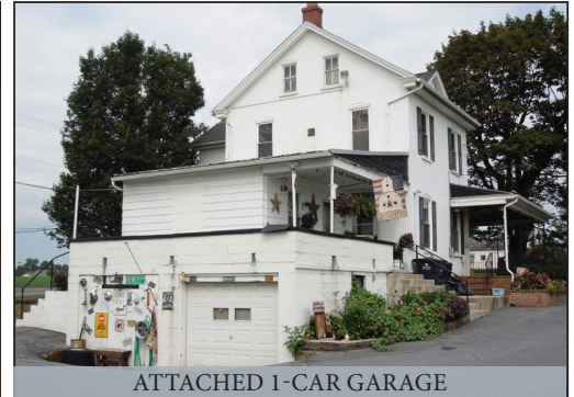
ATTACHED 1-CAR GARAGE

Located at 511 Martindale Rd. Ephrata, Pa. Earl Twp. Lancaster Co.