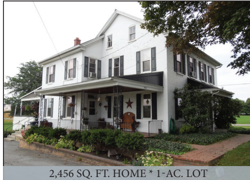
2,456 SQ. FT. HOME * 1-AC. LOT