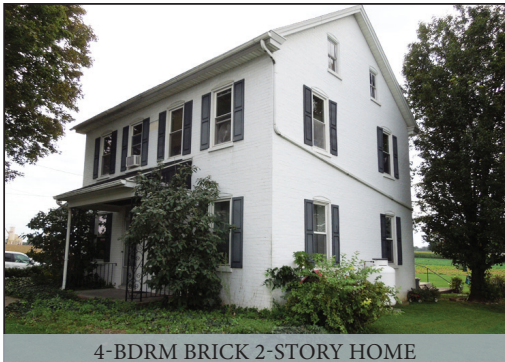
4-BDRM BRICK 2-STORY HOME