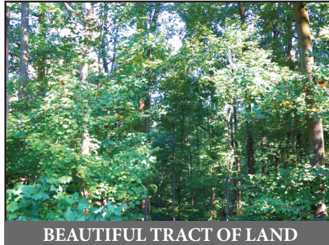
BEAUTIFUL TRACT OF LAND