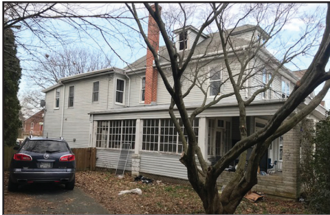
3 BEDROOM SEMI