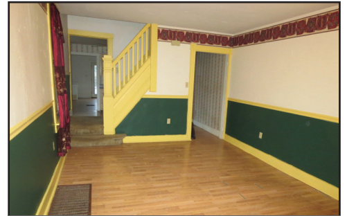
FRONT LIVING ROOM

Located at: 284 W. Franklin St. Ephrata Pa. 17522