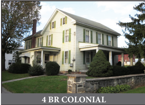
4 BR COLONIAL