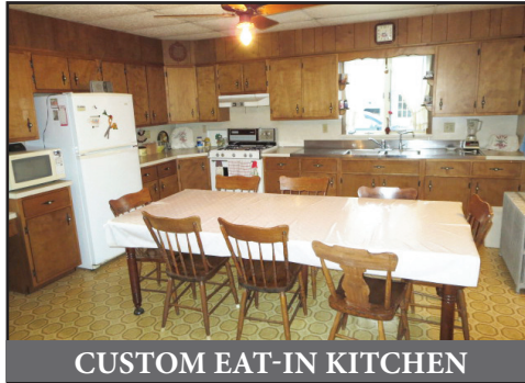
CUSTOM EAT-IN KITCHEN