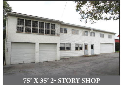
75' X 35' 2- STORY SHOP

Located at: 34 East Farmersville Rd. Ephrata Pa. 17522