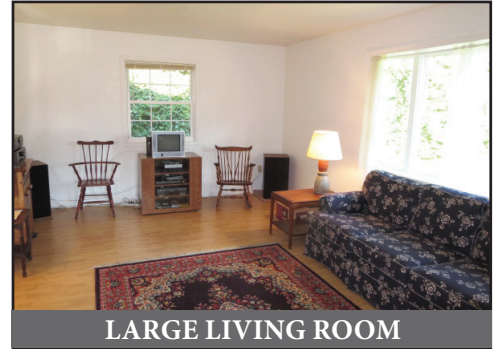
LARGE LIVING ROOM

Located at: 907 Grings Hill Rd. Sinking Spring Pa 19608