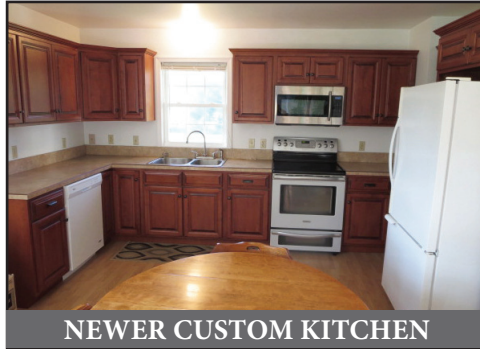
NEWER CUSTOM KITCHEN