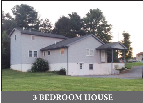
3 BEDROOM HOUSE