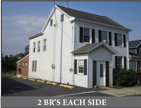
2 BR'S EACH SIDE