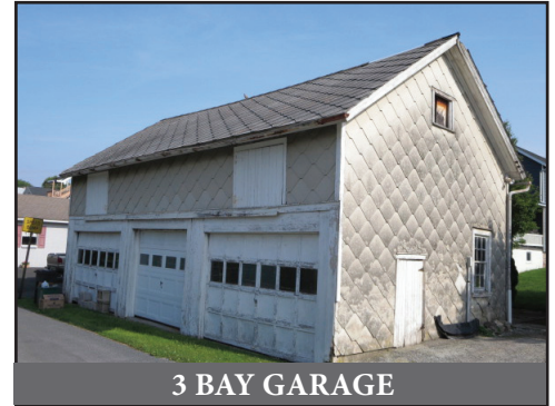
3 BAY GARAGE

Located at: 135 & 137 West Main St. Terre Hill Pa 17581