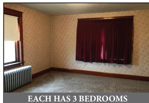
EACH HAS 3 BEDROOMS

Located at: 1849 Division Hwy. New Holland Pa 17557