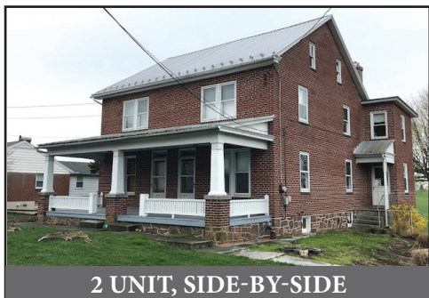
2 UNIT, SIDE-BY-SIDE