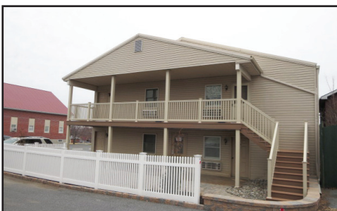
(4) 1-BEDROOM APARTMENTS