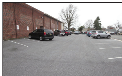
24 PARKING SPACES

Located at: 20 N. Roberts Ave. New Holland Pa 17557