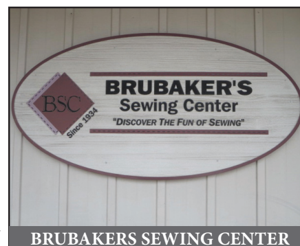
BRUBAKERS SEWING CENTER

REAL ESTATE: A very clean Commercial/Retail/Residential property w/ large building & (4) 1-bedroom apartments. Retail has beautiful updated covered storefront for retail business; 6,030 sq. ft. total retail (4,455 main level & 1,575 second level) 2 oversized show windows (Street Side); 12' ceiling; office area; work area; storage area; updated inside & new carpet in 2015; updated & very efficient electric heat pump & A/C unit (5 ton & 2 ton); well insulated; formal front & side entrances w/ double doors; 24 space parking lot w/ new macadam in 2015; firewall & steel fire door between residential & commercial. Also has 4 residential apartments; each has 875 sq. ft., 1 bedroom w/ closet, kitchen & cabinetry w/ all new appliances, open to living area, 1 full bathroom; laundry room; electric heat & A/C; rear entrance for apartments is all new in 2017 w/ stone-pavers & maintenance-free deck, fencing. Public water & sewer; 5 individual electric meters; insulated windows; convenient location close to public transportation stop; lot is approx. 17,468 sq. ft. (.38 Acre); total taxes are approx. $8,640.00