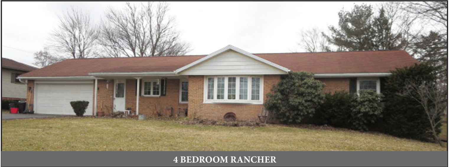
4 BEDROOM RANCHER

Located at: 803 Glenwood Dr. Ephrata, Pa 17522